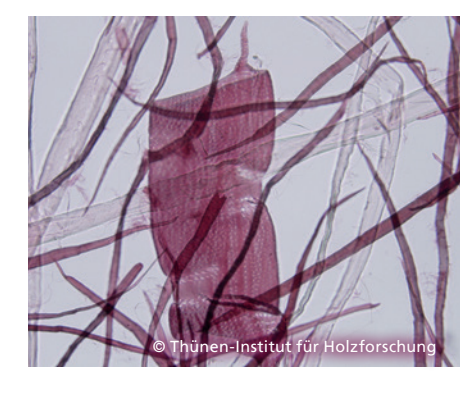
Fiber analysis of a eucalyptus from the Thünen Institute for Wood Research

"This is where our algorithms come into play," explains Stephani. Using reference specimen that the Thünen Institute produces from its huge wood inventory and makes available as high-resolution microscope images, the researchers train neural networks. Ultimately, the goal is to succeed in uniquely identifying wood. "At the moment, we are only dealing with hardwoods, because here every tree species has unique markers." The goal of the project, however, is a database of all common wood species.