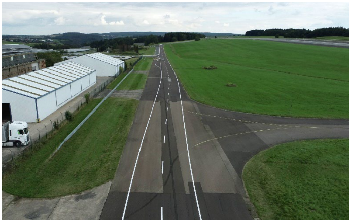
Digitization of environmental data: Automotive Test Center Pferdsfeld. Real photo.